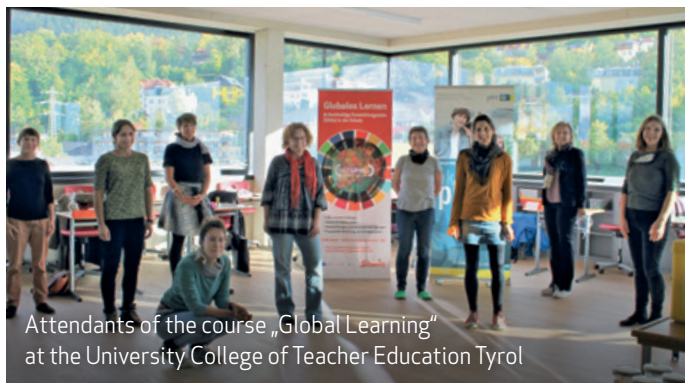
Attendants of the course „Global Learning“ at the University College of Teacher Education Tyrol

Global Learning (Global Citizenship Education) needs social learning and face-to-face exchange. The challenges posed by the Covid crisis to SÜDWIND's educational work in 2020 were correspondingly huge. In many cases, new methods had to be developed to provide for variety and interaction during virtual trainings, and overall we were quite successful in that regard. And we were confronted with another, equally important issue, the unequal access to the prerequisites for distance learning: Not everybody has a quiet room, a computer, a reliable internet connection and the necessary basic computer skills. For SÜDWIND, overcoming these barriers will be a growing concern in the future. To provide a good and inclusive education, one has to recognise that people have different starting points in their lives.