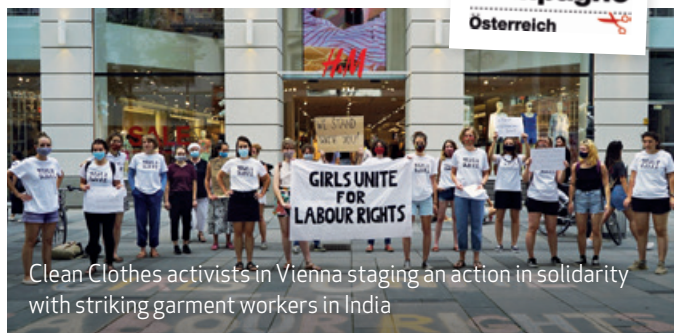
Clean Clothes activists in Vienna staging an action in solidarity with striking garment workers in India

In July, in Downtown Vienna, activists staged a solidarity action to support women