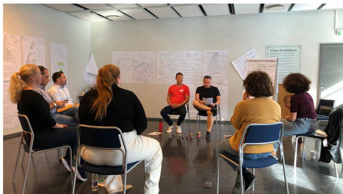
Pilot Training Workshops were organized in Iceland, Italy, Austria, Cyprus and Greece